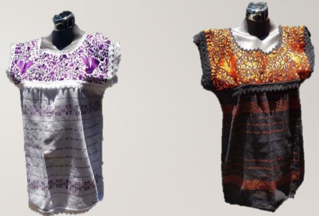
HANDMADE BLOUSES FROM OAXACA

A dressmaker can help you choosing a design o even change the size or color. All that with extra cost.