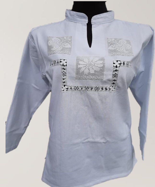
HANDMADE BLOUSES FROM MORELIA

A dressmaker can help you choosing a design o even change the size or color. All that with extra cost.