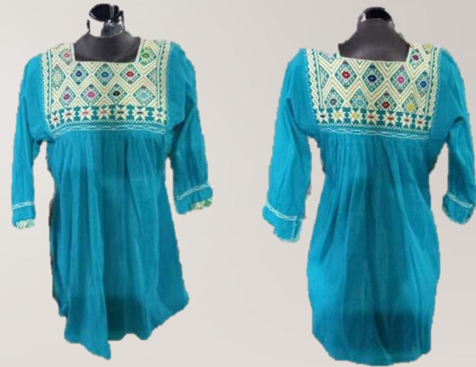
BLUSAS ARTESANAL REGION CHIAPAS

A dressmaker can help you choosing a design o even change the size or color. All that with extra cost.