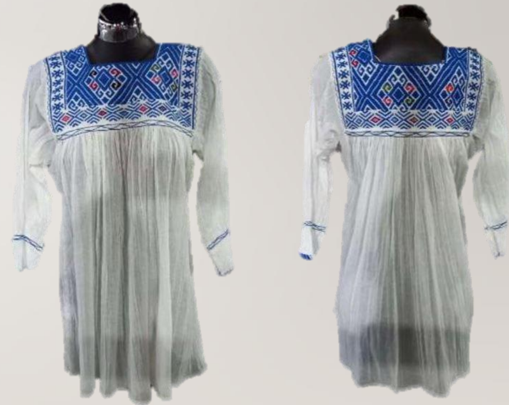
BLUSAS ARTESANAL REGION CHIAPAS

A dressmaker can help you choosing a design o even change the size or color. All that with extra cost.