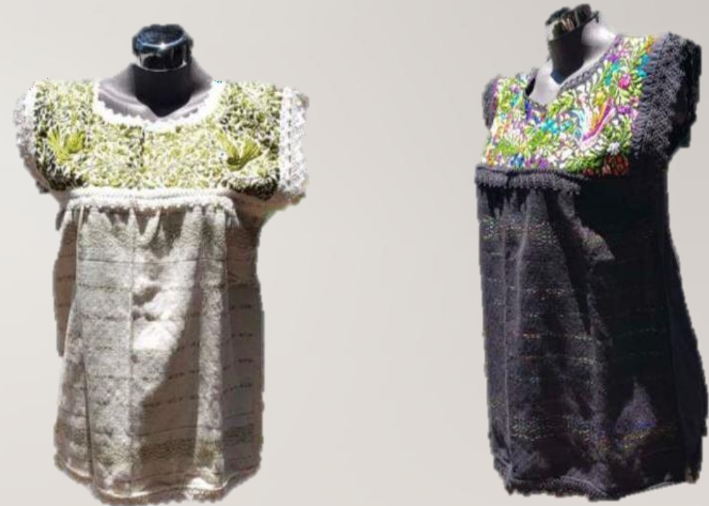
HANDMADE BLOUSES FROM OAXACA

A dressmaker can help you choosing a design or even change the size or color. All that with extra cost.