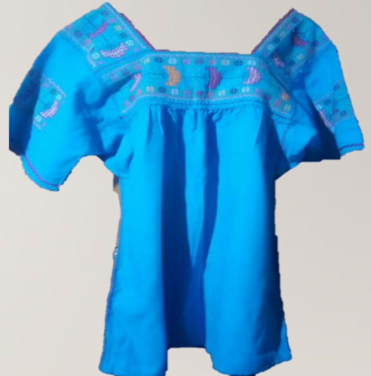
HANDMADE BLOUSES FROM MORELIA

A dressmaker can help you choosing a design o even change the size or color. All that with extra cost.