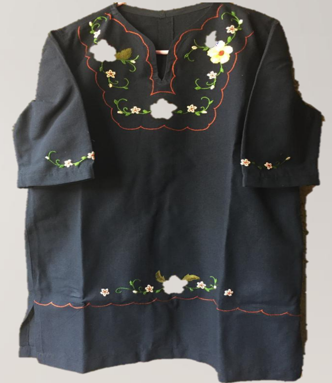
HANDMADE BLOUSES FROM MORELIA

A dressmaker can help you choosing a design o even change the size or color. All that with extra cost.