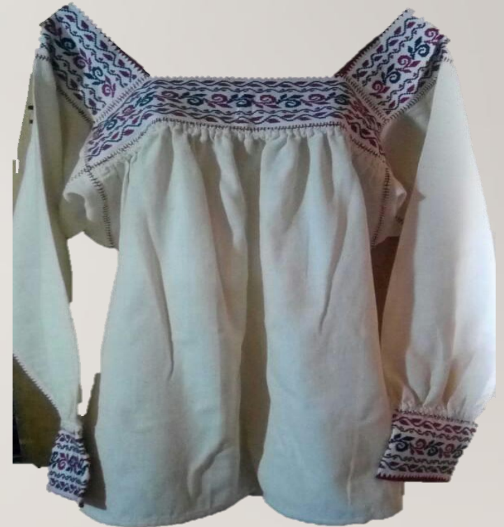
HANDMADE BLOUSES FROM MORELIA